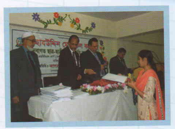
Student received internship certificate from Hon' able Chairman