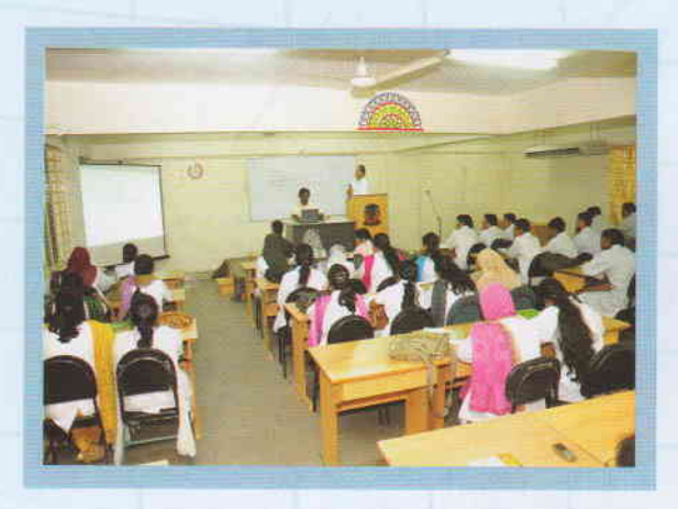
Student attending Lecture class