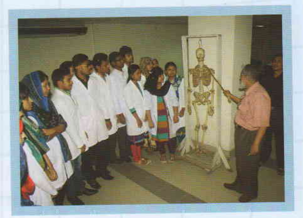
Student's attending anatomy class