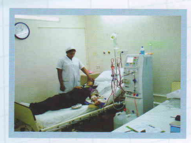
Kidney Dialysis Unit