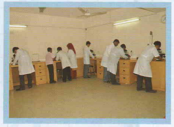
Student attending practical traning in LAB