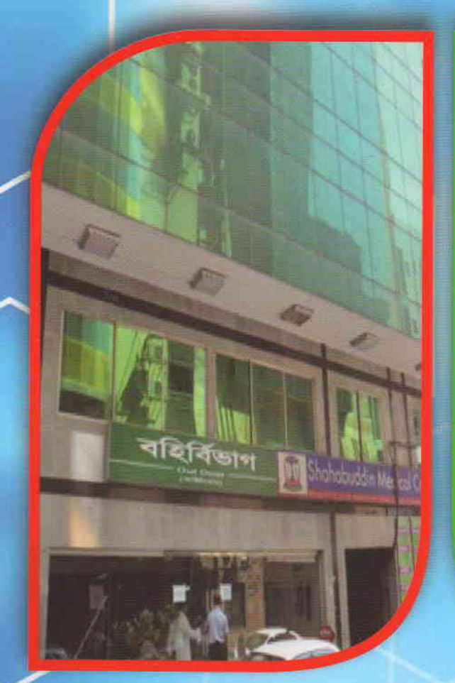
500 Bedded Hospital Complex