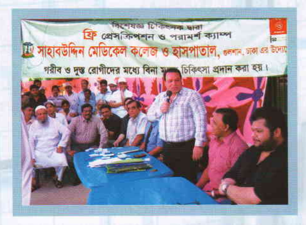
Free Medical Camp